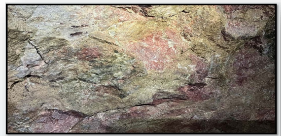
Anclyte Mineralization on right rib in Sheep Creek Adit