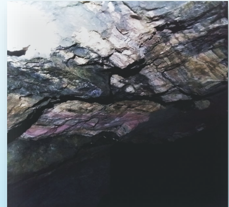
Banded Carbonatite with Anclyte

The TREE (Total Rare Earth Element) at Sheep Creek averages 9% and the mineralization is up to feet wide, with highly mineralized carbonate dikes that go up to feet wide.